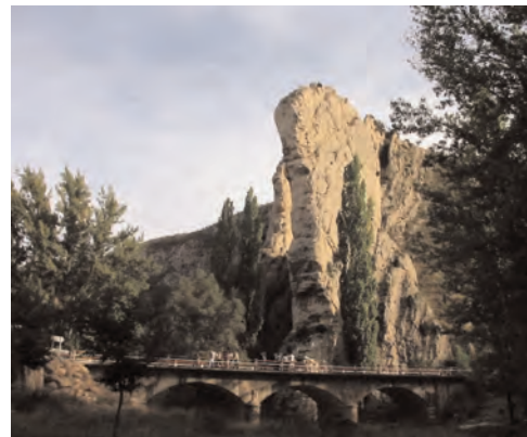
Photograph 1. La Porra, Aliaga Geopark (Maestrazgo Geopark)