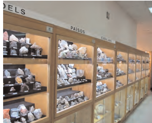
Photograph 8. "Valentí Masachs" Geology Museum. Central Catalonia Geopark

This museum is very useful to explain the minerals and rocks, and from there the associated derivative products due to its important rock and mineral collection, in addition to a complete collection of fossils found in the park zone. The Geopark Scientific Council office is currently located in this museum, which can be seen in Photograph 8.