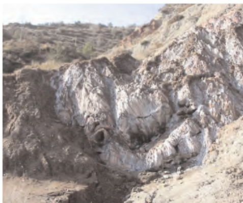
Photograph 4. Outcrops of HALITE and CARNALITE in the Cardona Salt Mountain. Future member of the Central Catalonia Geopark

Nevertheless, the only superficial outcrops of these minerals are located in the locality of Cardona. There are outcrops of the so-called Cardona Formation , which extends through wide sectors of the geopark subsoil. Photograph 4.