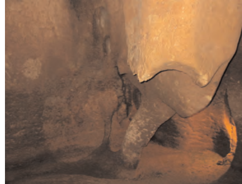
Photograph 7. Toll Caves Prehistoric Park in Moià. Central Catalonia Geopark

This centre, located in a zone with an important karstic morphology, would specifically develop the Geopark's geological patrimony together with a general experience of the park's geology: geomorphology and rock types, regional tectonics, external geological processes, karstification, anthropology (hominoid remains), etc. Part of the cave can be seen in Photograph 7.