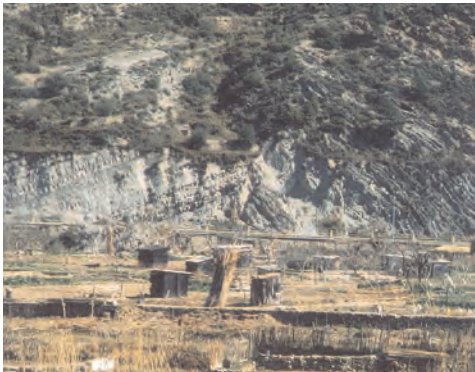
Photograph 6. The Mig Món anticline fault, in Súria. Central Catalonia Geopark.

All issues related to mining patrimony would be developed here, including the geological explanation, in all senses, that the different natural resources have generated, and the geological history (paleogeography and sedimentary environments, etc.), as well as the mechanisms and installations created by human beings to access the minerals and rocks, and their evolution throughout history. Some of these elements may be seen in Photograph 6.