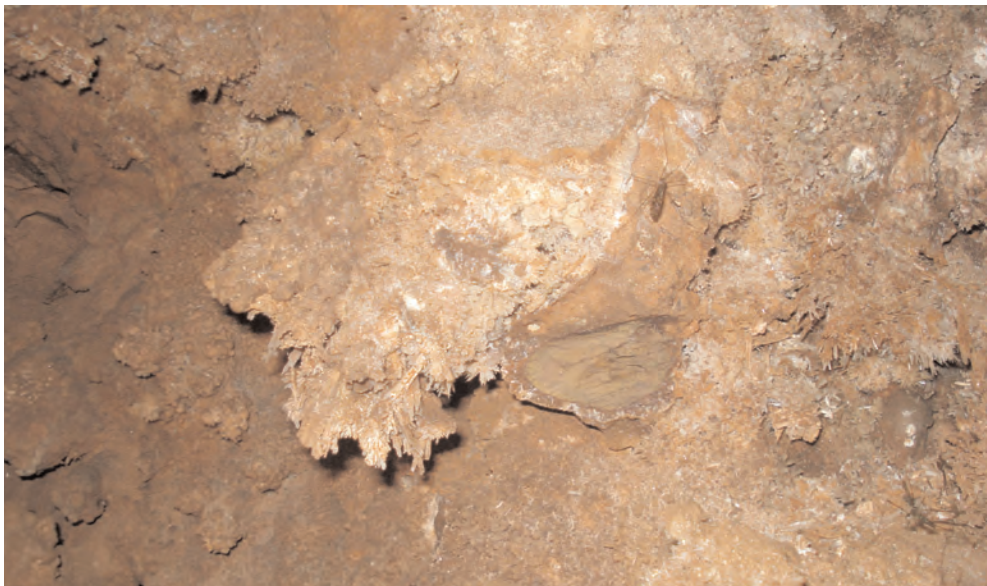
Photograph 5. ARAGONITE in the Mura Caves. Central Catalonia Geopark.

Given the Geopark’s characteristics, the drafting team at the time appraised the possibility of established several visitor centres, as well as a central office (located in one of these centres). Within the territory proposed for the Geopark there are currently four centres that are working on the dissemination of geology. In order to minimize infrastructure costs from the start of the Geopark’s activity, it was decided that these would be the main centres of interpretation, attention and channelling of visitors.