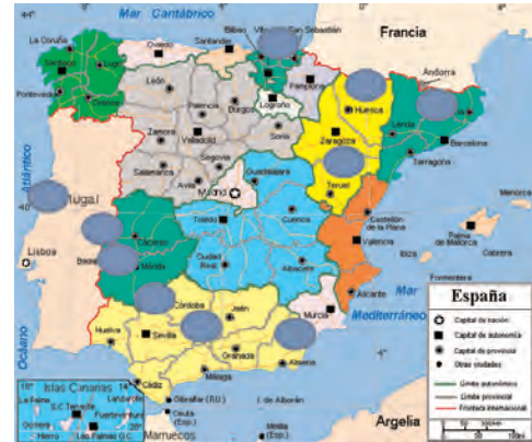
Fig. 1. Distribution of Geoparks in the Iberian Peninsula

Figure 1 shows their distribution, while Photographs 1 and 2 show some of the elements in two of the geoparks, specifically those situated in Aragón.