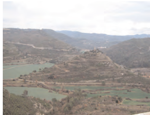
Photograph 3. The abandoned meander of River Calders, one of the elements in the Central Catalonia Geopark

One of the best-known sites is the famous Cardona Salt Mountain , one of Catalonia's Sites of Geological Interest . Nevertheless, due to restructuring of the Geopark, it is currently not included although work is underway to include it in the next few years. It is currently established as a close agreement of collaboration.