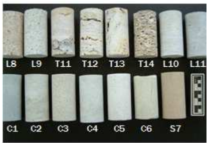
fig.1. Image of the studied samples. C: biocalcarenites. T: travertines and tufas. L: limestones. S: sandstones.

In this study, 15 porous stones have been chosen for their different petrophysical and petrographic characteristics (Figure 1 ).