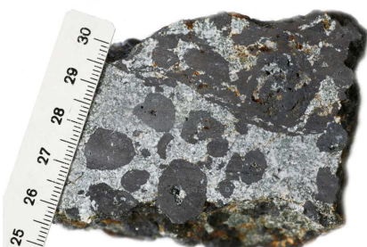
fig 4. Hand sample of nodular graphite in diorite