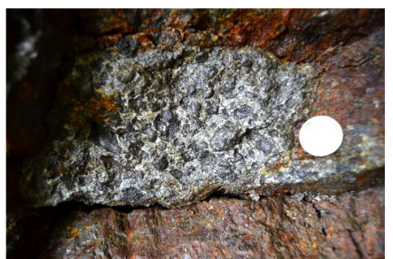
fig 3. Detail of the graphite ore body at Taisho adit

The best exposures are found at Taisho adit, where a more or less tabular ore body occurs. It is oriented N150°, coincident with one of the main directions of the fault system in the area. Thus, the mineralized body appears to be structurally controlled and show sharp contacts with the wall rocks. The thickness of the graphite ore body is some 30 cm (Fig. 3). Graphite mainly occurs as nodules (from 1-2 millimetres to 2-3 centimetres in diameter) and irregular patches embedded in a greenish white host-rock (Fig. 4). Locally, graphite nodules and patches form massive concentrations with very scarce host-rock. The host rock may be stained by the oxidation of sulphides associated with graphite.