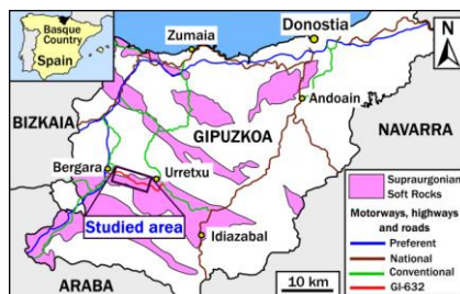
Fig. 1. Schematic map of weak rock outcrops in the Gipuzkoa Province, showing the location of the studied area (modified from EVE, 2003).

this new approach applying it to the rocks of the GI-632 highway sector.