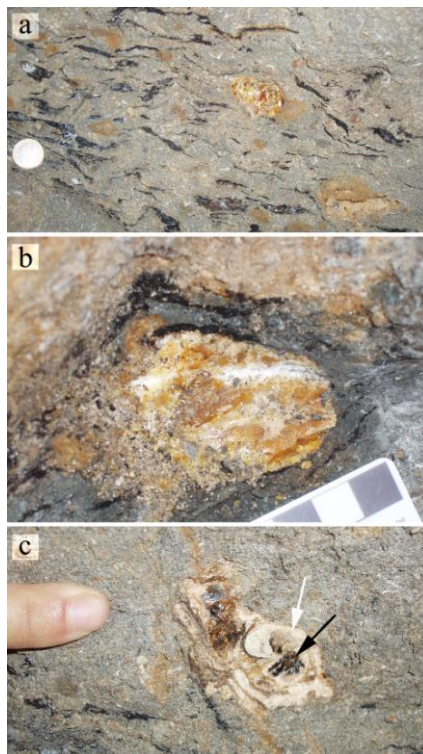
fig. 2. Moratalla amber in situ inside the mined galleries; a) orange amber piece associated with abundant coal (scale= 1 euro coin); b) orange amber piece strongly fractured (scale = 3 cm); c) piece with a red core (black arrow) surrounded by a typical light-brown cortex (white arrow).

Overlapping the Jumilla Formation there is a marly interval of the Chera Marls Formation. The dolostones, sandstones, and marls together form the Tosca Formation of Hoedemaeker (1973). The thick dolomite unit named as "Ubacas dolostone formation" by Hoedemaeker (1973) was considered as the Alatoz Dolostone Formation by Martín-Chivelet (1992).